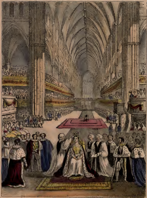
Illustration by J. Armstrong & Co. London